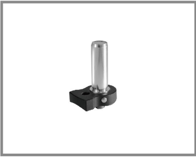
Tonometer Adaptor (R type) (For R type applanation tonometer)