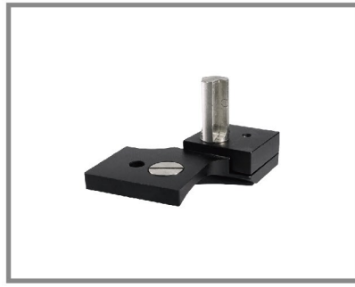
Tonometer Adaptor (870 type) (For 870 type applanation tonometer)