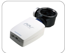
Firefly Digital Camera +Beam splitter

It's easy to upgrade your S360/S360s to a Digital Slit Lamp with Firefly Digital Module Kit (Firefly Digital Camera, Beam Splitter, MediView Software, USB Cable, Background Illumination Module)