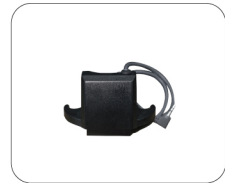
Background Illumination Module